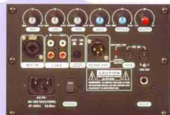
▲ Inputs: MIC IN x 1, LINE IN