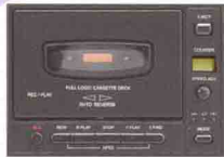
▲ Tape Deck